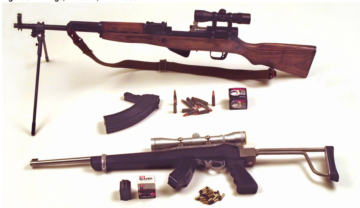
Figure 3: Billings, Montana, Purchases

7.62mm Russian-Manufactured Samozariadnyia Karabina Simonova Semiautomatic Rifle With Bipod Rest, 4x Scope, 30-Round Banana Clip, and 7.62mm Ammunition (Top)