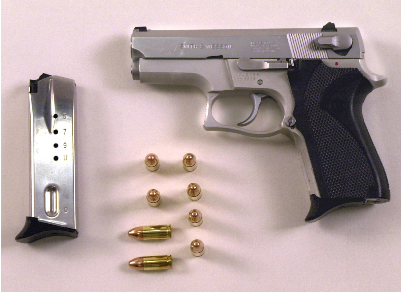
Model 6906 Smith & Wesson 9mm Stainless Steel Semiautomatic Pistol With 12-Round Ammunition Magazine

The gun store salesperson requested that the agent complete ATF Form 4473 and a Virginia State Police firearm purchase form. After checking both forms to make sure information provided was identical and complete, the salesperson ran the standard instant background check on the fictitious name, date of birth, and social security number provided by the undercover agent. He also provided the same information to the Virginia State Police for a state criminal record check. The records checks by both NICS and the Virginia State Police immediately came back with a proceed-to-sell response, meaning that no criminal record was associated with the