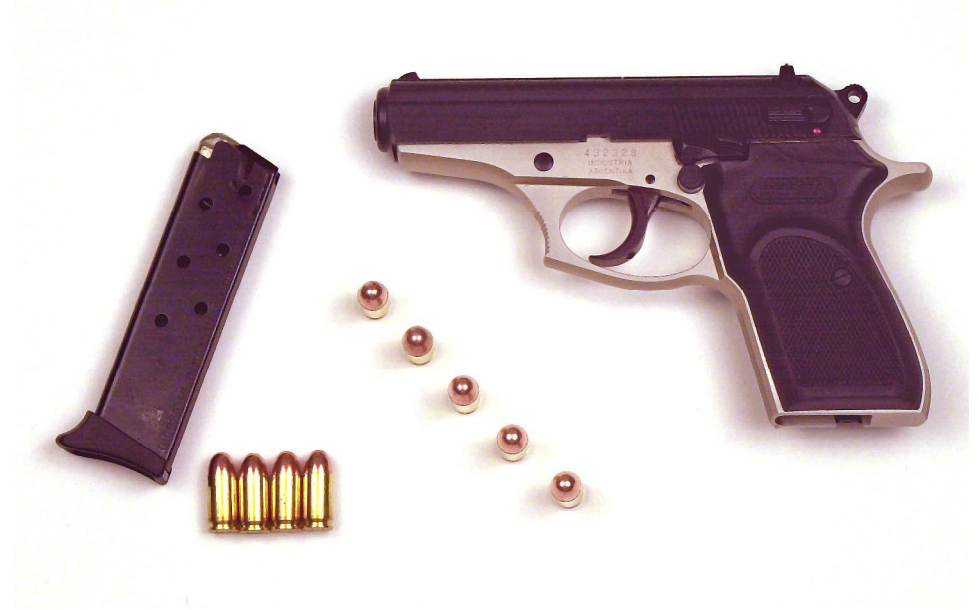
.380 Bresa Semiautomatic Pistol With 8-Round Magazine and .380 Ammunition

The agent presented a counterfeit West Virginia driver's license and completed the ATF Form 4473. The initial NICS check by the salesperson came back with a delay response, indicating that the system was either down or that the name, date of birth, and/or social security number submitted was similar to ones associated with a criminal history. The salesperson told the agent that NICS had 3 business days from the time he called in the name-check to respond and that if NICS did not respond within that period, he could sell the firearm to the agent. During this transaction, the salesperson stated that his main concern about a delay notification from the NICS was the potential loss of the sale. In this case, the proceed-to-sell order came back from NICS in less than 24 hours. The agent returned to the sporting goods store, paid for the firearm and ammunition, and departed the store with the merchandise and a companion agent.