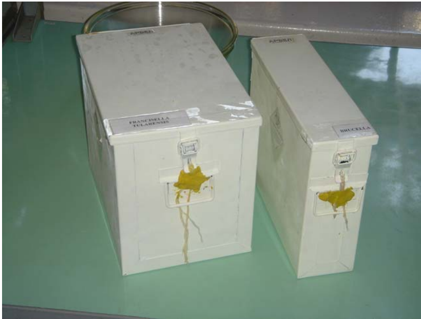
Storage boxes used to safeguard dangerous biological pathogens, such as anthrax, are secured with wax seals. Nunn-Lugar plans to increase security surrounding these dangerous poisons.

be a stronger cooperation by Ukraine on biological pathogen threat reduction. “It is clear that the professionals at the Central Sanitary Epidemiological Station are excited about the prospects of working closely with their American counterparts and cooperating on joint research to address infectious diseases,” Lugar said.