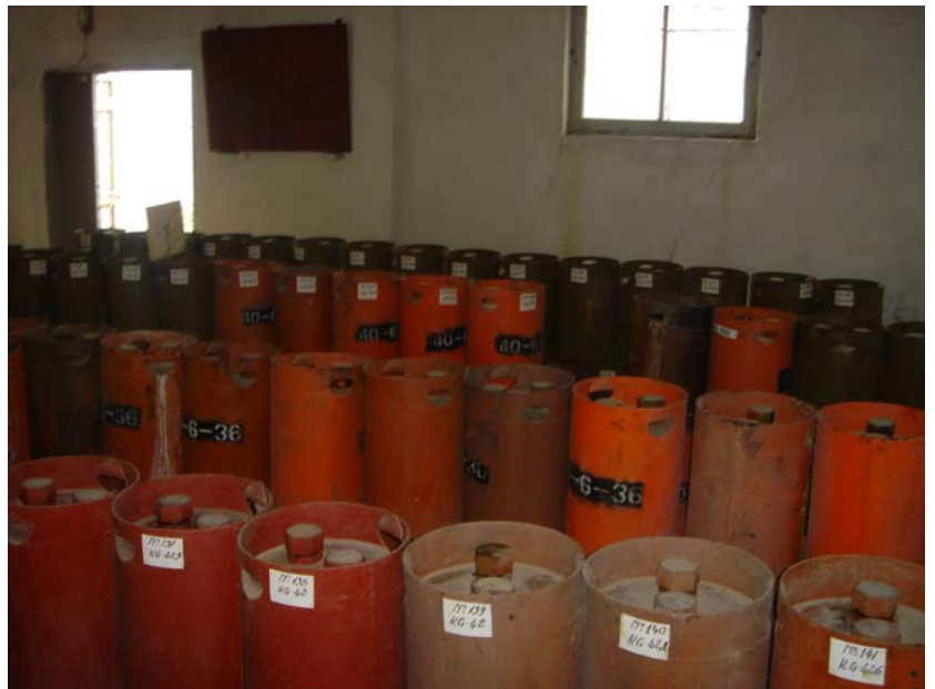
Room filled with chemical weapons canisters that will be destroyed by the Nunn-Lugar program. Lugar visited the site on August 27.

The utilization of the Nunn-Lugar program in