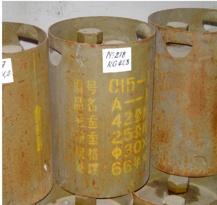
Rusty chemical weapons containers Albania obtained from China that will be destroyed under the Nunn-Lugar program.

It has improved military-military contacts between the U.S. and Russia and established greater transparency in areas that used to be the object of intense secrecy and suspicion. It can offer the same benefits in other countries if we are prepared to devote the