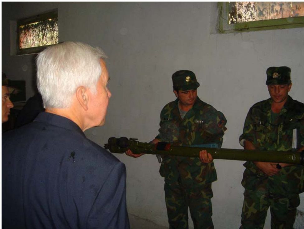
Senator Lugar observes Albanian military officials explain to how to operate a MANPAD shoulder-fire missile.

These missiles, designed to shoot down military aircraft and helicopters, could be used by terrorists to attack commercial airliners. Numerous reports have suggested that al Qaeda has attempted to carry out such attacks on several occasions. More good news: the missiles I saw have been destroyed, and the U.S. plans to continue to help Albania destroy others in the months ahead.