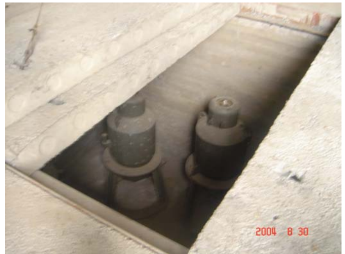
Radioisothermic generators in Georgia that contain dirty bomb material in newly installed safe storage provided by the United States.

The Nunn-Lugar program is dismantling the dual-use equipment and analyzing options for expanding the vaccine production, which currently includes those for foot-and-mouth disease and rabies. An animal feed and micronutrient pre-mix plant is one option.