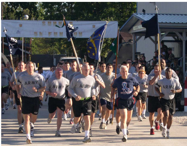
Senator Lugar running with the Indiana National Guard Troops at Eagle Base, Bosnia.

In his speech, Lugar addressed the amount of time that U.S. forces have been in Bosnia.