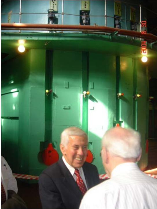
Senator Lugar visits with scientists at a Georgian facility where Nunn-Lugar launched a classified mission to remove nuclear weapons material under Operation Auburn Endeavor in 1998.

This is a shining example of international cooperation advancing science and improving the quality of life,” Lugar said.