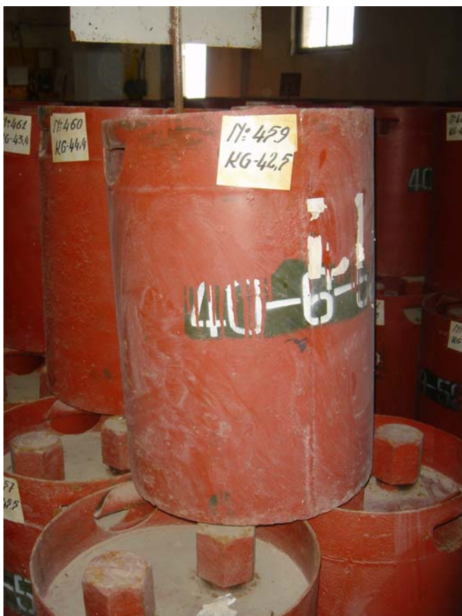
A close-up photograph of a dusty chemical weapon canister stored in Albania.

Albania was facilitated by the May 2003 Agreement Between the Republic of Albania and the Government of the United States of America Concerning Cooperation in the Area of the Prevention of Proliferation of Weapons of Mass Destruction and the Promotion of Defense and Military Relations. This agreement will provide the foundation for the Nunn-Lugar Program work. The United States has delivered a draft implementing agreement to the