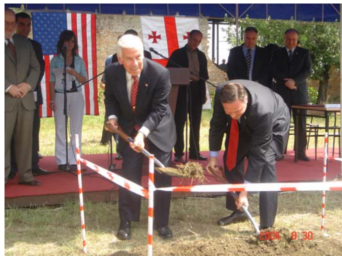
Senator Lugar at the groundbreaking for the new biological pathogen storage center in Tbilisi, Georgia.

“Georgia’s Center for Disease Control scientists, in partnership with U.S. Army Medical Research Institute of Infectious Diseases (USAMRIID), including personnel from Walter Reed Hospital, and other international scientists, are making significant contributions to public health and disease surveillance.