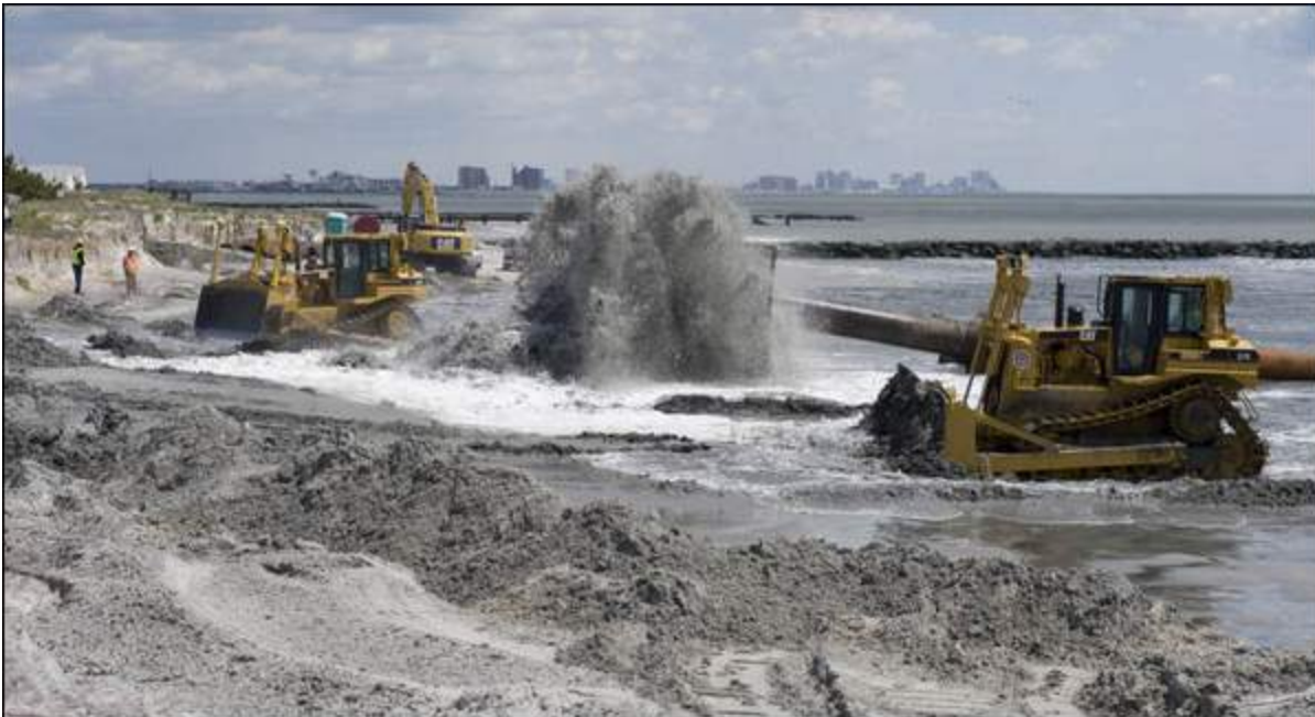
BEACH NOURISHMENT

The Minerals Management Service (MMS) at the Department of the Interior is also involved, as it conveys the rights to offshore sand to various coastal restoration projects. Through its cooperative sand evaluation program with coastal states, MMS is involved in identifying offshore sand that is most compatible with the sand at the beach being restored. This is intended to help minimize harmful negative environmental impacts and future coastal erosion of the restored beach. 40