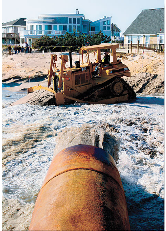
SURF CITY BEACH, NEW JERSEY, NOURISHMENT

Those beachfront property owners who do not want publicly funded beach nourishment, are being forced to give up their private property rights to accommodate an inflexible state entity with questionable motives. In this Destin, Florida case, in particular, local county officials had already unsuccessfully attempted to increase