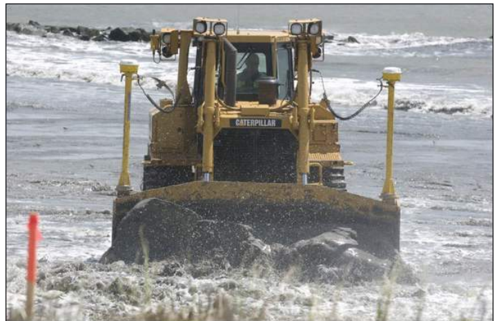
BULLDOZING DREDGED MATERIAL

According to scientists and environmental groups, coral reefs and the local ocean ecosystems they support can also be damaged by beach nourishment. Both dredging and filling have the ability to crush and kill coral reefs. Filling the beach also clouds the water and does not allow for sunlight to reach bottom dwellers. Introducing non-native sediments can also affect the toxicity and character of the water, further impacting the coral reef’s native habitat. Impaired reefs degrade the habitat of numerous other species including tropical fish, groupers, snappers, sea turtles, crabs, and lobsters. 141 Numerous studies continue to