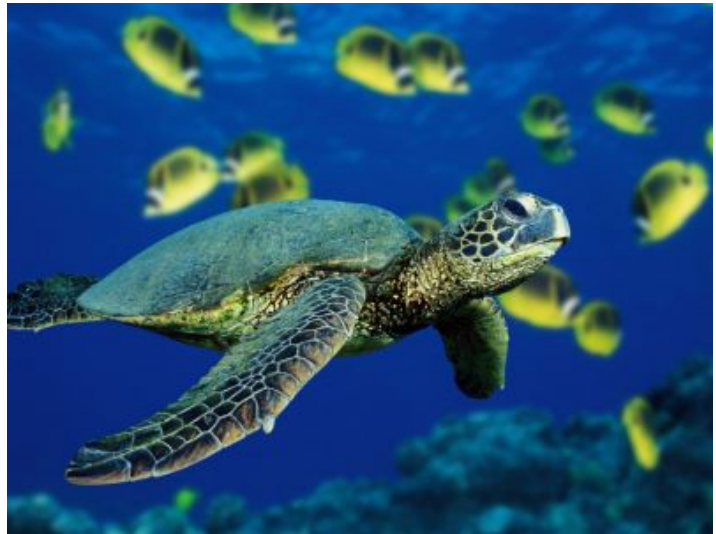
THE GREEN SEA TURTLE (PHOTOGRAPH UNATTRIBUTED)

“Dredge material can smother near-shore creatures such as sand fleas, damaging the food chain. It can also cause plumes of turbidity, or suspended sediment, that settle onto coral reefs, smothering them, too. In Palm Beach, Fla., in 2006, lifeguards closed the beaches because 11 miles of plumes made swimmers nearly invisible to schooling sharks.” 134