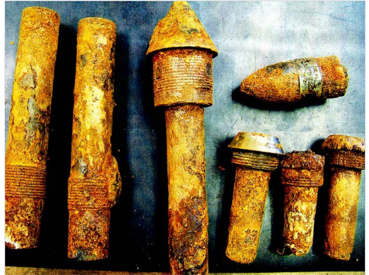
U.S. MILITARY FUSES AND ADAPTORS FOUND ON LONG BEACH ISLAND, NEW JERSEY – SOME CONTAINING UNEXPLODED GUN POWDER

In the San Diego, California area, concerns are being raised that a beach nourishment project will use sand from a site once home to a Navy gunnery. 158