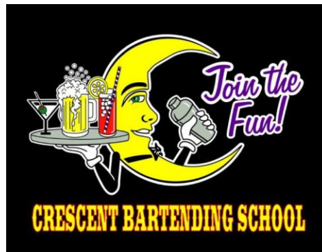
The Crescent School of Gaming and Bartending “provides access to federal financial assistance by way of Pell Grants and student loans.” 196

Like all other service – and entertainment-related jobs, bartending and jobs in gaming require distinct skills and knowledge. It is sobering to taxpayers and job seekers alike, however, that Washington is providing duplicative training programs for these types of jobs without any evidence to demonstrate they put Americans back to work.