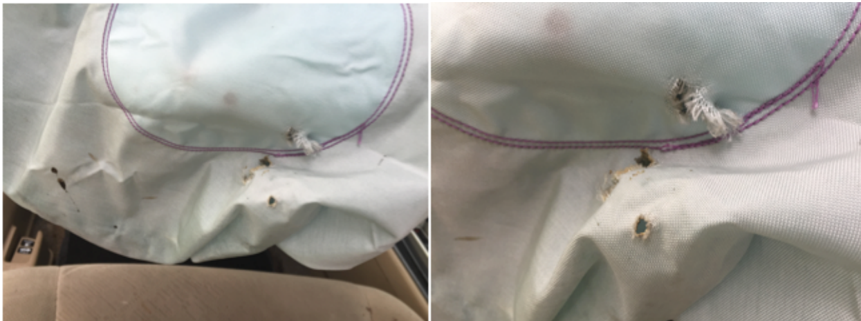
FIGURE III: AIRBAG CUSHION WITH HOLES CAUSED BY SHRAPNEL 135

Piece of metal shrapnel recovered from the neck of a Florida resident after the airbag ruptured in his 2003 Honda Civic on March 20, 2015.